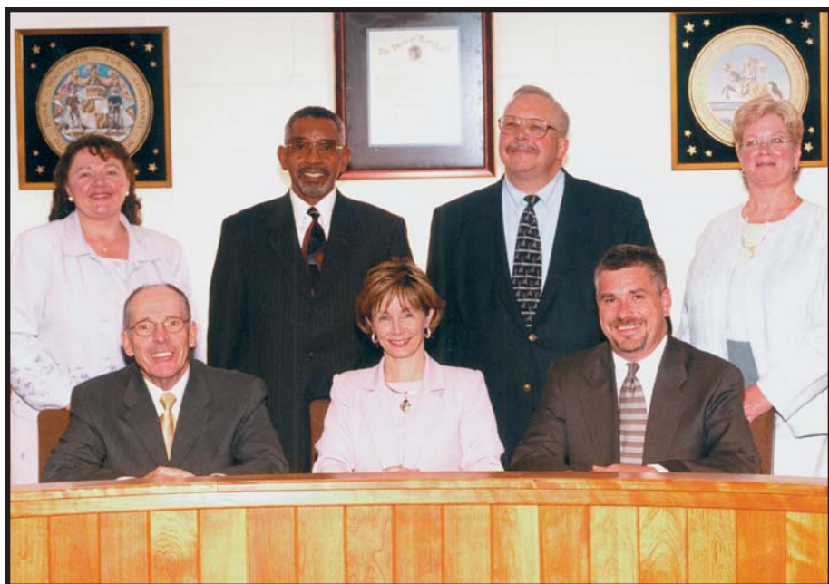
The 2003 Board of Education of Washington County