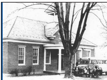
Fairplay School, around 1940